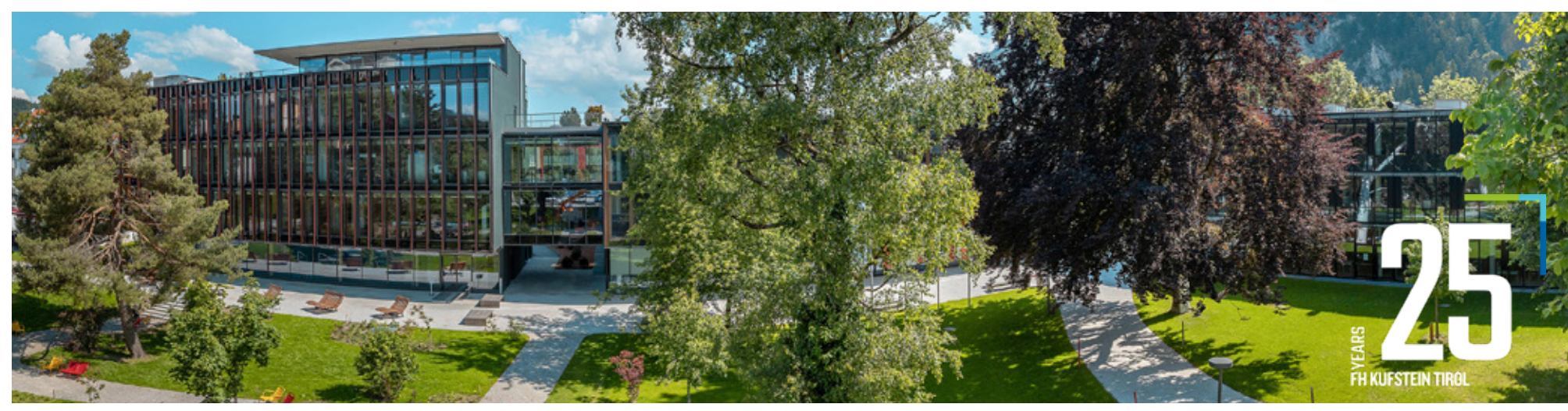
The newly designed campus of FH Kufstein Tirol: four modern building sections, the integrated library and a separate laboratory wing in the middle of the beautiful city park.