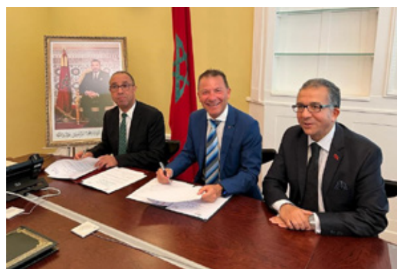
Cadi Ayyad University is the new partner university in Morocco.

were received in Kufstein from 25 nations. International delegations from Malaysia, Japan and Finland were hosted at FH Kufstein Tirol in order to discuss existing student mobility and strategic immersions. The International Relations Office is responsible for handling, expanding and cultivating the relationships of the international network.