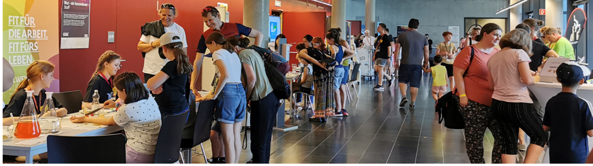
Excitement at the University of Applied Sciences due to the Long Night of Research with 950 guests in attendance.