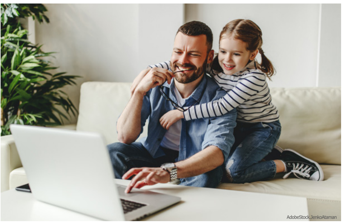
The goal at FH Kufstein Tirol is to optimally balance work and family life.

Together with kununu, Statista and XING, the economics magazine trend has once again determined the 300 best employers in Austria. This year, FH Kufstein Tirol was awarded first place in Tyrol, across industries and in the Austria-wide university comparison.