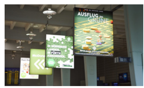
Premium visibility and brand presence for advertising surfaces are important commercial factors for airports.

The technology thereby visualized human behavior and made it possible to analyze gazes and perceptions. After collecting the research data, the students analyzed the results and derived optimization measures for deployment, placement and