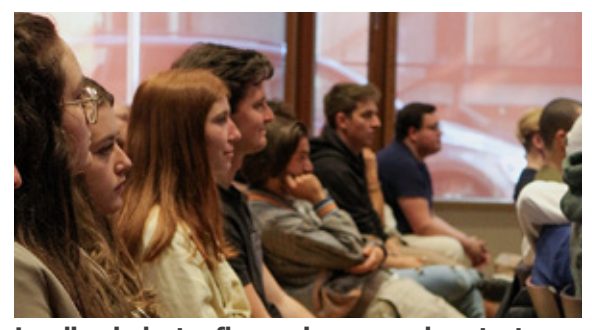
Leading industry figures in personal contact with students

The family company Oberalp Group from South Tyrol has positioned itself with clear, ethical guidelines; specifically, the topic of sustainability is omnipresent within the Oberalp Group. Axel Brosch