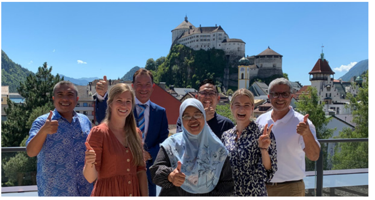
A visit from the Malaysian delegation led to an extension of the partner agreement.

After more than two years, the international education community was finally able to meet again in person at the education conferences NAFSA in the US and EAIE in Barcelona. FH Kufstein Tirol took advantage of this opportunity to again engage in person with numerous partners from all over the world and solidify its excellent cooperation with its partner universities both on a bilateral level as