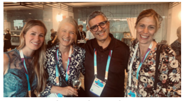
IRO Team at the EAIE in Barcelona

After more than two years, the international education community was finally able to meet again in person at the education conferences NAFSA in the US and EAIE in Barcelona. FH Kufstein Tirol took advantage of this opportunity to again engage in person with numerous partners from all over the world and solidify its excellent cooperation with its partner universities both on a bilateral level as